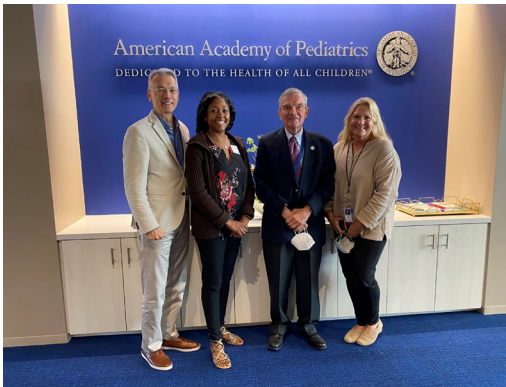
AAP HQ, Itasca Illinois